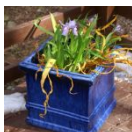
A-Top View B-Side View C-Full-stalk D-GLAMOUR shot

An AIS Silver Medal and Certificate will be awarded for the largest number of blue ribbons and an AIS Bronze Medal and Certificate for the second largest number of blue ribbons.